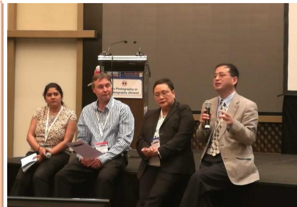
FOP WORKSHOP Q&A SESSION